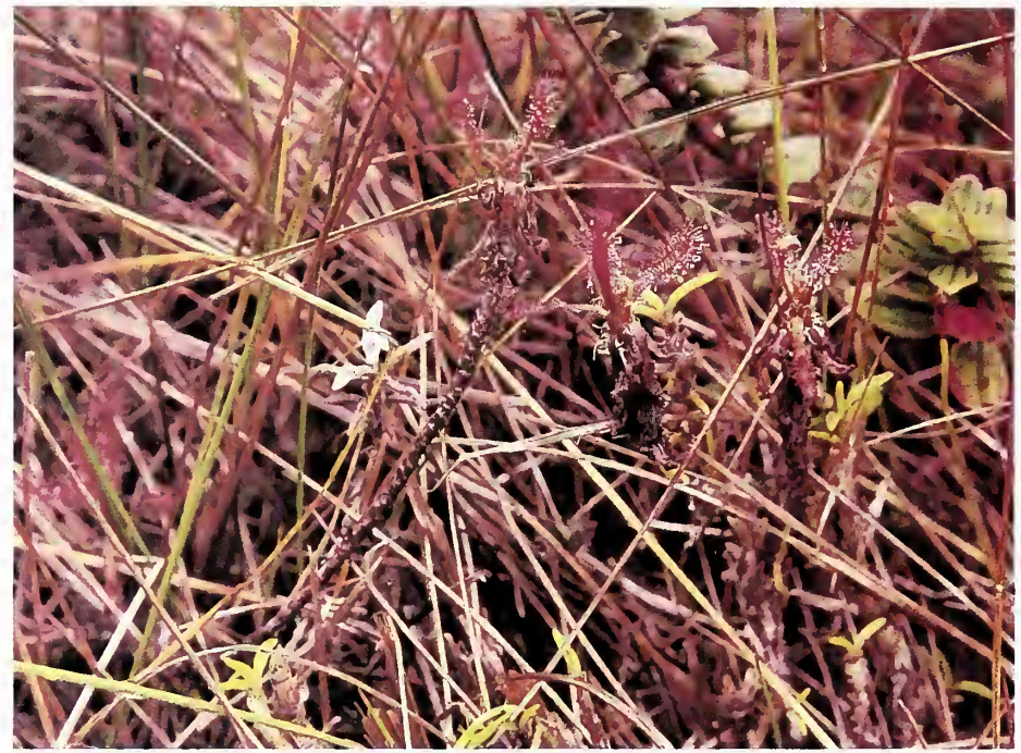
Figure 1: Drosera humbertii, 2100 m a.s.l., eastern summit of Marojejy, Antsiranana.